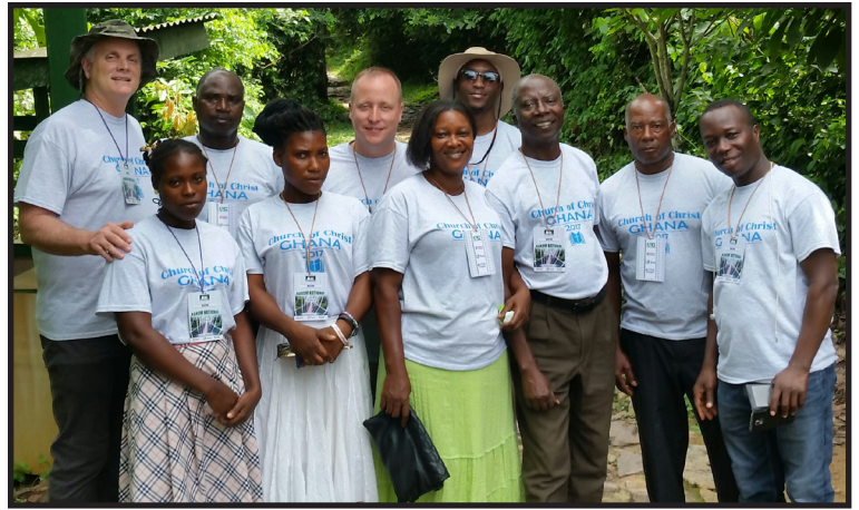
The entire immediate Ghana team (minus Bob Bauer, who took the picture), including five Americans and seven Ghanaians. The three women worked very hard preparing meals and hand-washing laundry. They were valuable team members.