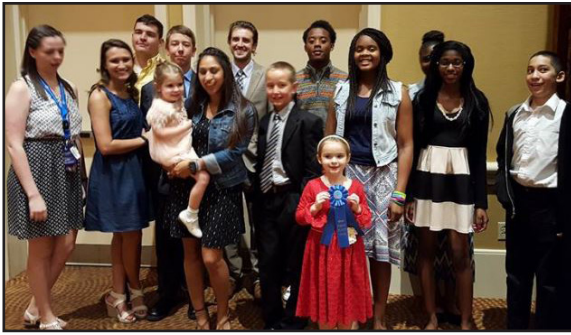
One of the few times our young people were together! Keep up the good work & “Be not weary in well doing.”