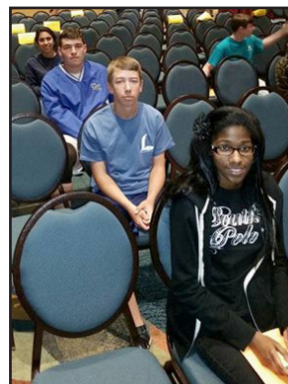
Bible Bowl team ready

Help us celebrate the accomplishments of our young people and encourage them to further cultivate their talents for the Lord’s service!