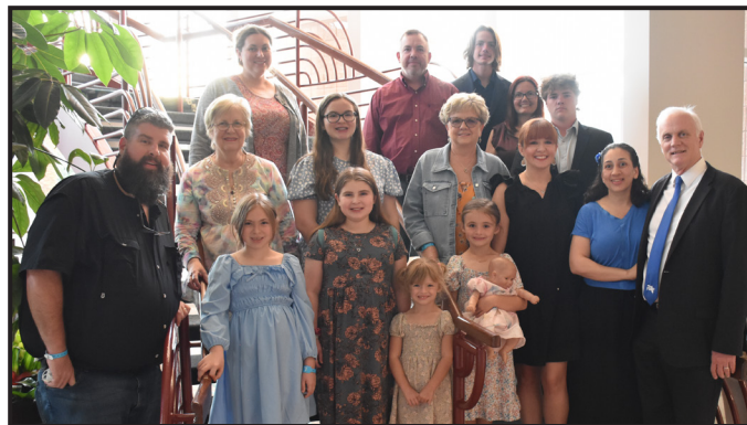
The 2024 SFA Lads 2 Leaders Group

Third, children bring happiness. “Happy is the man who has his quiver full of them; They shall not be ashamed, But shall speak with their enemies in the gate” (Ps. 127:5). With a “quiver full” of children, the happiness is twofold: (1) the father would not be ashamed; and (2) the father would be defended. The plurals “they ... their” (singulars in ESV) still speak of the father but in general terms to include all fathers. “Enemies in the gate” refer to adversaries in a legal [Continued on page 3]